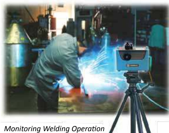
Monitoring Welding Operation

Applications for light scattering dust monitor include Indoor air quality investigations, Point source monitoring, and Personal exposure monitoring.