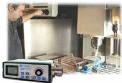
Monitoring Milling Operation